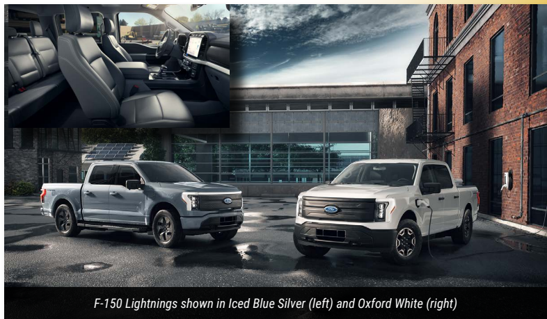
F-150 Lightnings shown in Iced Blue Silver (left) and Oxford White (right)

The F-150 Lightning is that vehicle – an all-electric, zero emissions, highly productive and powerful Ford pickup.